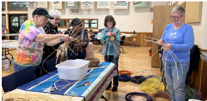
Basketweaving was among the textile arts many did.