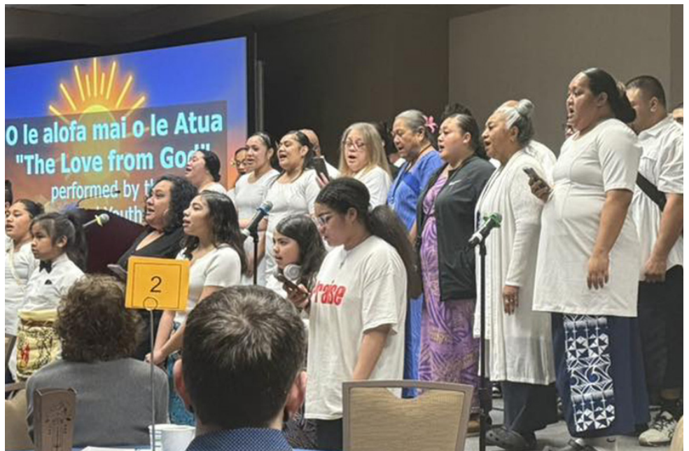
Youth and adults from Samoan churches led worship songs and danced.

This report was compiled with the Continued on page 4