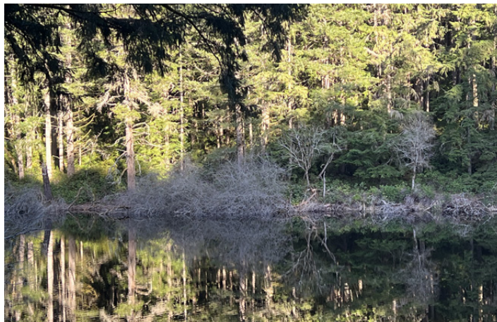
Lake Flora at Pilgrim Firs was a peaceful spot for clergy.

The clergy spent time kayaking, canoeing, hiking around Lake Flora, playing games and