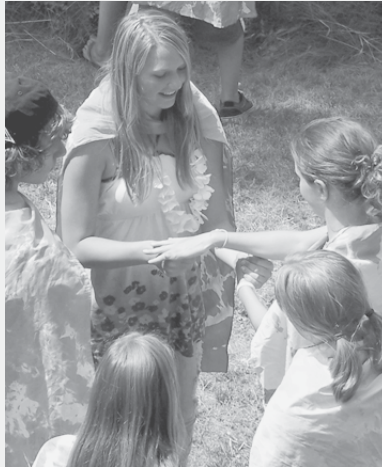
Drama plays role in camp learning.

At N-Sid-Sen, Mid-Winter Youth Retreat will be held March 11 to 13; the